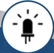
HIGH INTENSITY LEDS

The Kam VMS variable message sign is a small variable message sign that can meet several needs. It can be used to communicate information to citizens. It can display messages according to the time and day of the week. Its 24" x 30" format makes the Kamelion the ideal tool for improving standard or intermittent road signage. Thanks to its RGB display, the Kamelion variable message sign can display up to 7-colors in order to improve the perception and reaction time of drivers. A software is included to allow easy message customization.