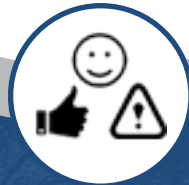
CUSTOMIZABLE PICTOGRAMS AND TEXTS