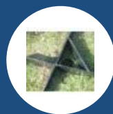
ANCHOR STABILIZER FOR SOFT GROUND #31582