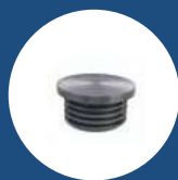
SLEEVE ANCHOR CAP #32534