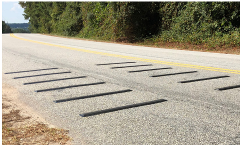
RibLine® Rumble Bars