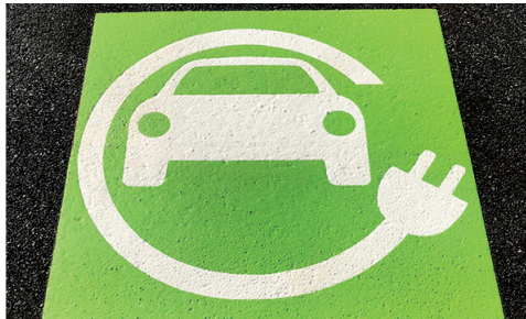
OPTDSIGN Preformed Thermoplastic