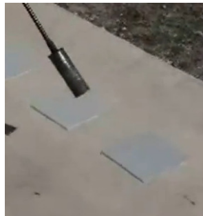
Heating Adhesive Pad