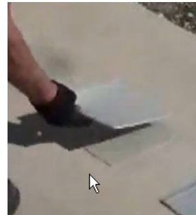
Placing Second Pad