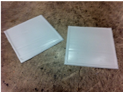
#IM-SBK Super Bundy Kit